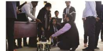
SCS organized Students Project Display Competition