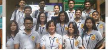
Workshop on "Recent Trends in Machine Learning & Soft Computing" attended at NIT, Durgapur