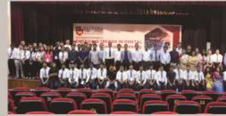
International Workshop on Emerging Trends in Digital Visualization & Mapping