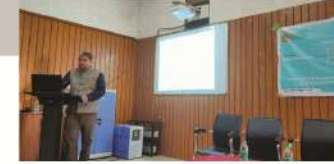
Workshop on "Innovation in Disruptive Technology"