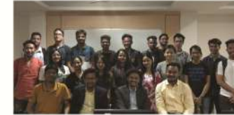
Workshop on "Cyber Security & Web Design" organized by SCS, KU