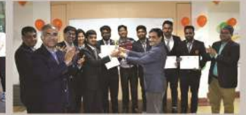
SCS Students emerged Champions in Storm Path KU (Internal Hackathon Event)