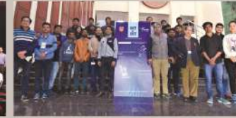
BIT by BIT - A Workshop on Cloud & Web Technology