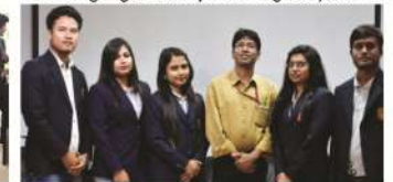
Students presented Papers on a Conference on "Advances in Science, Engineering & Technology" at GIMT, Tezpur